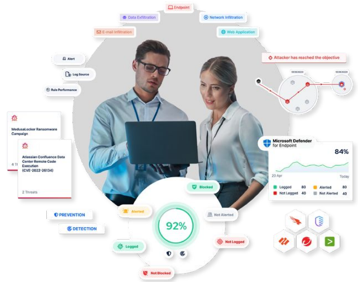
With The Picus Platform, gauge your threat-readiness at any moment and take swift action to strengthen resilience